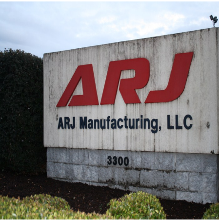
ARJ Manufacturing, LLC located in Jackson, TN

Governor Bill Haslam and the Tennessee Department of Workforce and Labor Development have announced a grant award to a Jackson manufacturing plant. ARJ Manufacturing, LLC located on Ridgecrest Road (Jackson) will receive a $25,000 grant for employee training. In a news release, the governor said the training grant not only helps educate workers, but also provides incentives to employers looking to relocate or expand in Tennessee.