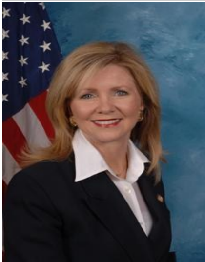
U.S. Congressman Marsha Blackburn represents the 7th District of Tennessee.

Workforce Investment Act Area-11 and Southwest Human Resource Agency will host a Job Skills Development Forum in the near future. The forum will feature guests that include U.S. Congressman Marsha Blackburn, U.S. Congressman Stephen Fincher, and representatives for U.S. Senator's Lamar Alexander and Bob Corker. State Senators and State Representatives who represent the LWIA-11 coverage area are also invited to attend the event.